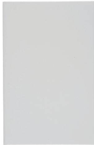
ACF069 6 x 9*

*This tile is dust pressed and has an approximate thickness of 3/8". All other flat tiles have a thickness of approximately 1/2".