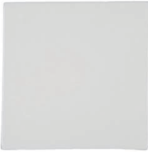
ACF066 6 x 6 *