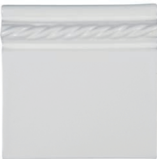
ACBSR2 6 x 6 Rope and Star Base