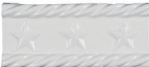
ACBOR2 2.5 x 5.875 Rope and Star Border