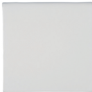
ACF066 6 x 6 Bullnose Single