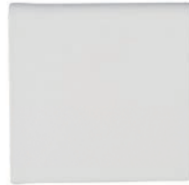
ACF044 4.25 x 4.25 Bullnose Single