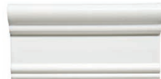
ACRL12 3 x 6 Central Park "C"