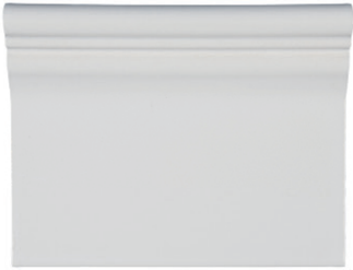
ACBS04 4.87 x 6 Park Avenue "B"