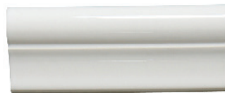
ACRL52 2 x 6 Fifth Avenue