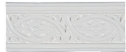
ACBOBF 3.25 x 7.5 Frieze "B" Border