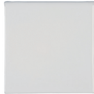
ACF066 6 x 6 Bullnose Corner