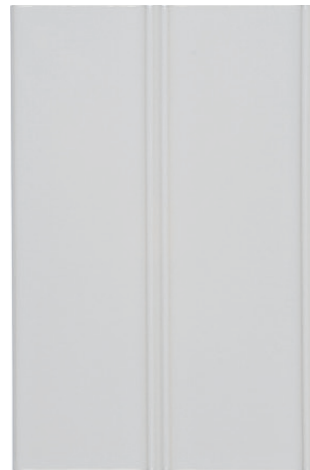
ACFDDB 6 x 9 Bead Board "B"

*This tile is dust pressed and has an approximate thickness of 3/8" (all other flat tiles have a thickness of approximately 1/2")