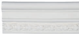
ACRLU6 2.5 x 6 Church Rail