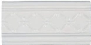
ACRLE2 3 x 6 Relief Rail