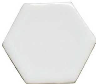
ACFHx6 6" Hexagon