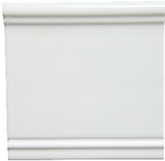
ACBS01 6 x 6 Fifth Avenue