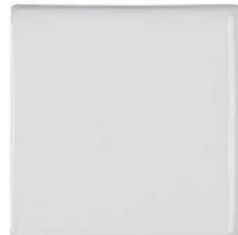
ACF044 4.25 x 4.25 Bullnose Corner