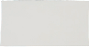
ACF036 3 x 6 *