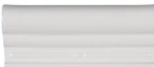
ACRL31 2.5 x 6 Bar and Dot "A" Rail