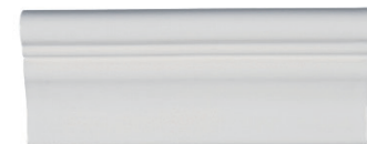
ACRL29 2.5 x 6 Park Avenue "A"