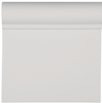
ACBS09 6 x 6 Columbus Avenue

*V-Cap option available in all bases except for Columbus Ave shown on this page