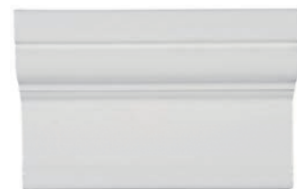
ACRL45 4 x 6 Lexington Avenue Two Leg "A"

*V-Cap option available in all rails except for first column of rails shown on this page