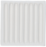
ACFD33 3 x 3 Flute Deco