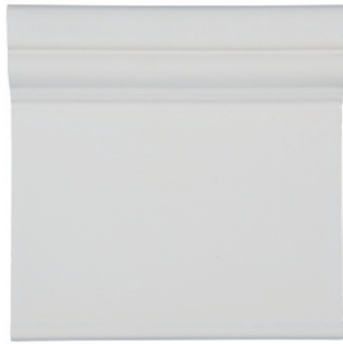
ACBS02 6 x 6 Lexington Avenue "B"