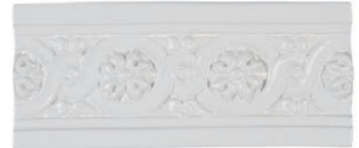
ACBOAF 3.25 x 7.5 Frieze "A" Border