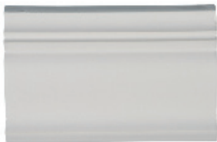
ACCW01 4 x 6 Lexington Avenue Crown