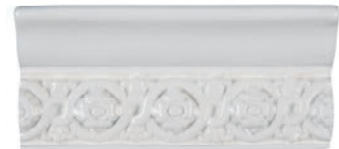
ACRLAF 2.75 x 6 Frieze "A" Rail