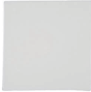
ACF066 6 x 6