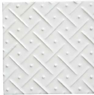
ACFDO5 6 x 6 Bar and Dot Field