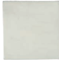
Gray Glossy Wash