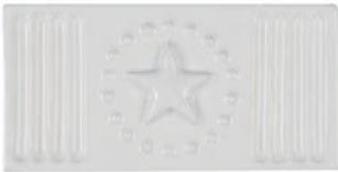
ACBOR3 3 x 6 Star and Flute Border