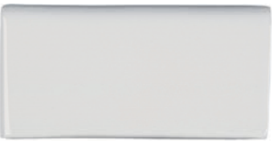
ACF036 3 x 6 Bullnose Corner (Left)