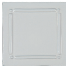
ACFDB4 4.25 x 4.25 Bar and Dot Deco