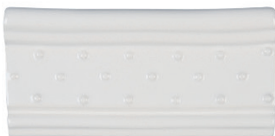
ACRL30 3 x 6 Swiss Dot "B" Rail