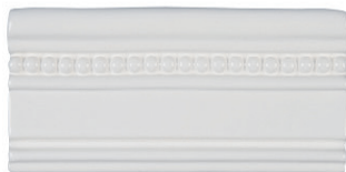
ACRL32 3 x 6 Swiss Dot Large "A" Rail