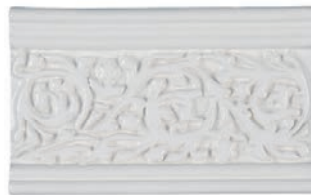
ACBOU2 4 x 6 Church Deco "C" Border