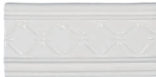
ACRLE1 3 x 6 Embossed Rail