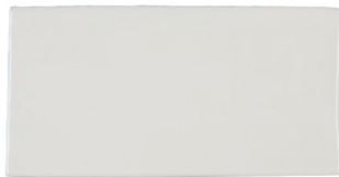
ACF036 3 x 6