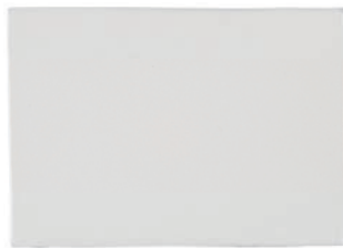
ACF046 4.25 x 6