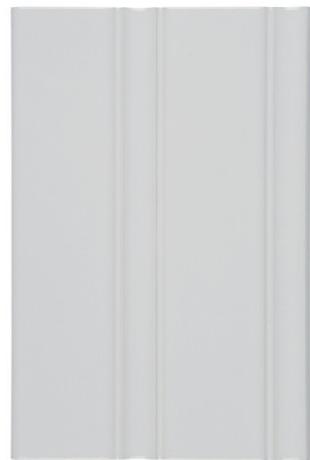
ACFDBC 6 x 9 Bead Board "C"