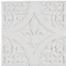
ACFU5 4.25 x 4.25 Church Deco "F"