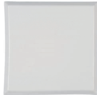
ACFB66 6 x 6