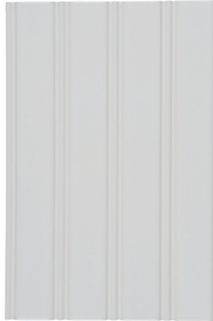
ACFDBA 6 x 9* Bead Board "A"

*This tile is dust pressed and has an approximate thickness of 3/8" (all other flat tiles have a thickness of approximately 1/2")