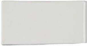
ACF036 3 x 6 Bullnose Single (Short)