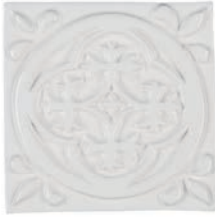
ACDFU6 4.25 x 4.25 Church Deco "A"