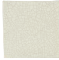
Black Stain Glossy Crackle