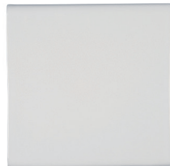
ACF066 6 x 6 Bullnose Jamb