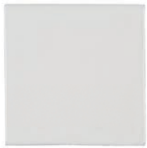
ACF044 4.25 x 4.25