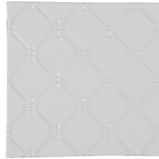
ACDFE6 6 x 6 Embossed Field