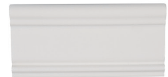
ACRL13 2.875 x 6 Fifth Avenue Two Leg "A"