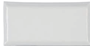
ACFB36 3 x 6