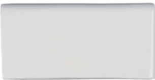
ACF036 3 x 6 Bullnose Corner (Right)