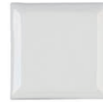
ACFB33 3 x 3