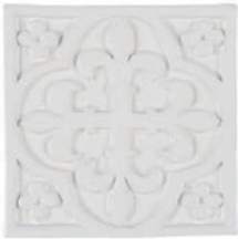
ACFU4 4.25 x 4.25 Church Deco "C"