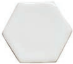
ACFHx3 3" Hexagon