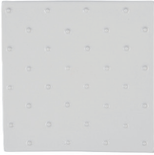
ACFDB6 6 x 6 Swiss Dot Field