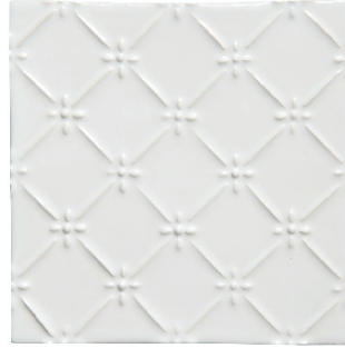
ACFDRI 6 x 6 Relief Field