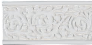
ACBOU9 3 x 6 Church Deco "B" Border