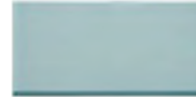
FIELD TILE 3" x 6" ( \frac{3}{8} "") STYLE NO. 316438