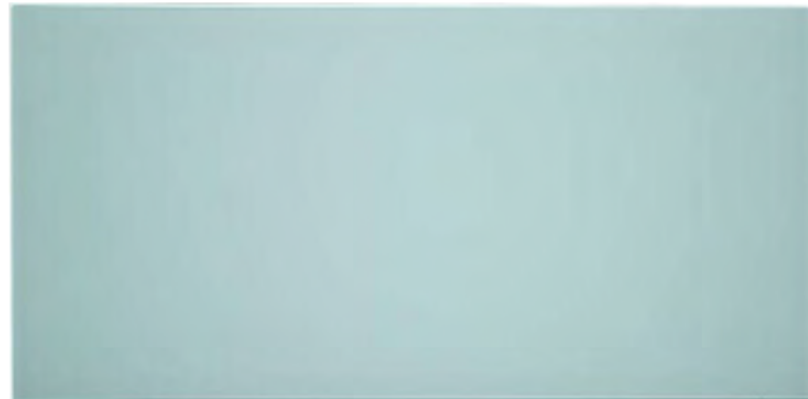
FIELD TILE 12" x 24" (3/8") STYLE NO. 216133