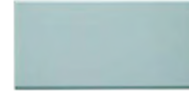
FIELD TILE 4" x 8" ( \frac{3}{8} "") STYLE NO. 966625