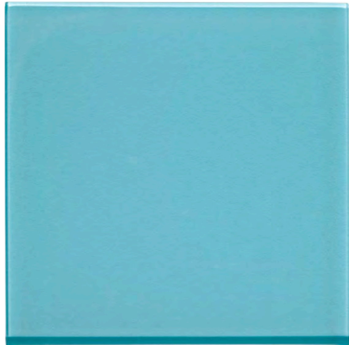
FIELD TILE IN POOL 6" x 6" (3/8")

The beauty of high-gloss Kromaglas tiles brings light to life in any space. This versatile collection includes a dazzling array of 27 shapes— from mosaic grids, to a skid-resistant floor tile, modern two-foot planks and complex architectural trims. In the tradition of fine Austrian glassmaking, pigments are fused with glass, resulting in ten jewel-toned shades of flawless character and brilliance. The calibrated, 8mm-thick field tiles work seamlessly with ceramic tile to offer a myriad of design possibilities.