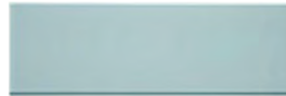
FIELD TILE 4" x 12" ( \frac{3}{8} "") STYLE NO. 874313