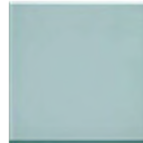
FIELD TILE 6" x 6" ( \frac{3}{8} "") STYLE NO. 479581