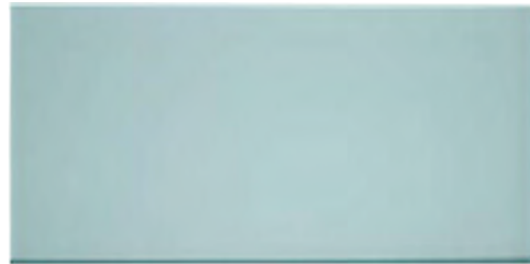
FIELD TILE 8" x 16" (3/8") STYLE NO. 200286