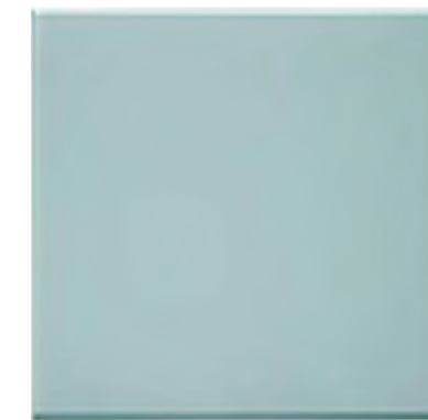
FIELD TILE 8" x 8" ( \frac{3}{8} "") STYLE NO. 892740