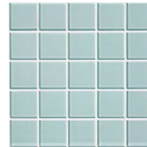
GRID MOSAIC 2" x 2" SQUARE STYLE NO. 591793