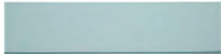
FIELD TILE 4" x 16" (3/8") STYLE NO. 435303