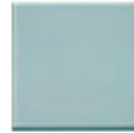
FIELD TILE 4" x 4" ( \frac{3}{8} "") STYLE NO. 351383