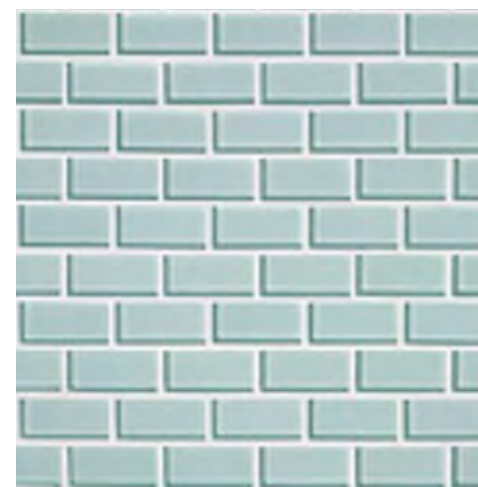
RUNNING BOND MOSAIC 1" x 2" BRICK STYLE NO. 776607