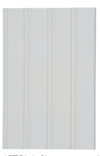
ACFDBA 6 × 9* Bead Board ''A''