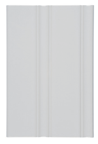
ACFDBC 6 × 9 Bead Board "C"