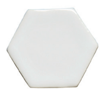
ACFHX6 6" Hexagon