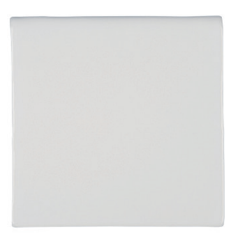
ACF066 6 x 6 Bullnose Single