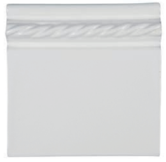
ACBSR2 6 x 6 Rope and Star Base