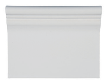
ACBS04 4.87 x 6 Park Avenue "B"