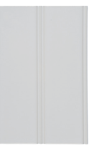
ACFDBB 6 × 9 Bead Board "B"