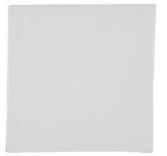
ACF066 6 x 6 *