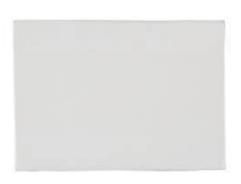
ACF046 4.25 × 6