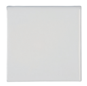
ACF066 6 x 6 Bullnose Corner