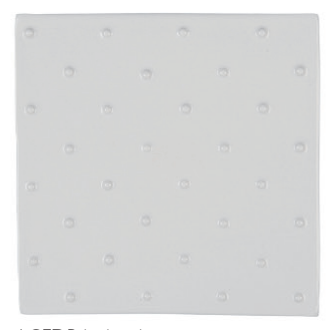
ACFDB6 6 × 6 Swiss Dot Field

\begin{array}{l} \text{ACLN27} \quad .5 \times 6 \\ \text{Swiss Dot Liner} \end{array}