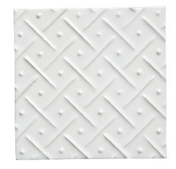
ACFDO5 6 x 6 Bar and Dot Field