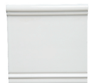
ACBS01 6 x 6 Fifth Avenue