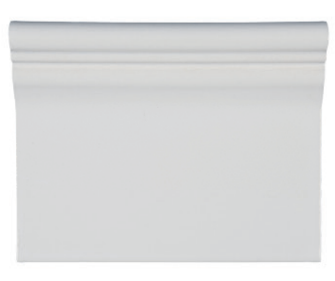
ACBS04 4.87 x 6 *** Park Avenue "B"