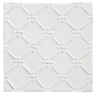
ACFDR1 6 x 6 Relief Field