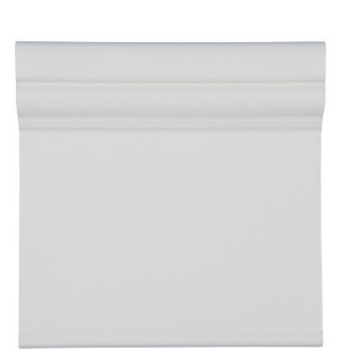
ACBS02 6 x 6 Lexington Avenue "B"