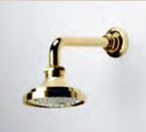
5" SHOWER HEAD, ARM AND FLANGE WITH ADJUSTABLE SPRAY CHROME 05-10331-25593 NICKEL 05-81067-23536 UNLACQUERED BRASS 05-08417-95773