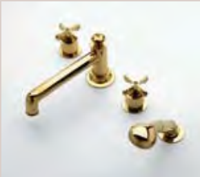
LOW PROFILE CONCEALED TUB FILLER WITH HANDSHOWER AND METAL CROSS HANDLES CHROME 09-03600-37919 NICKEL 09-32244-16351 UNLACQUERED BRASS 09-03252-19835