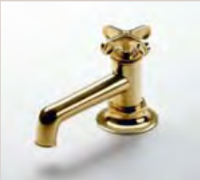
LOW PROFILE ONE HOLE DECK MOUNTED LAVATORY FAUCET CHROME 07-59692-11864 NICKEL 07-16231-33886 UNLACQUERED BRASS 07-67438-09164