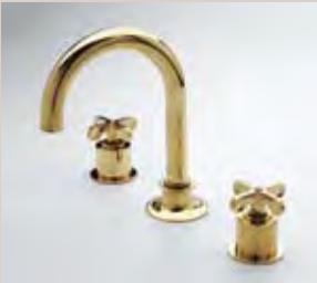
GOOSENECK THREE HOLE DECK MOUNTED LAVATORY FAUCET WITH METAL CROSS HANDLES CHROME 07-08581-57760 NICKEL 07-64366-67286 UNLACQUERED BRASS 07-21370-28386