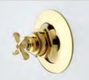
THERMOSTATIC CONTROL VALVE TRIM WITH METAL CROSS HANDLE CHROME 05-38988-79335 NICKEL 05-79212-17619 UNLACQUERED BRASS 05-71933-75006