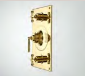
METAL LEVER HANDLE THERMOSTATIC WITH METAL CROSS HANDLE SHUTOFF TRIMS CHROME 05-30024-97440 NICKEL 05-04870-27285 UNLACQUERED BRASS 05-68686-78150