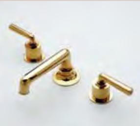
LOW PROFILE THREE HOLE DECK MOUNTED LAVATORY FAUCET WITH METAL LEVER HANDLES CHROME 07-43693-45860 NICKEL 07-49200-82754 UNLACQUERED BRASS 07-33957-43110