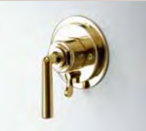
PRESSURE BALANCE WITH DIVERTER TRIM CHROME 05-49830-68746 NICKEL 05-50485-06874 UNLACQUERED BRASS 05-58979-40179