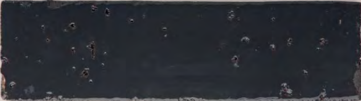
NAVAL DEEP BLUE 02-63651-50220