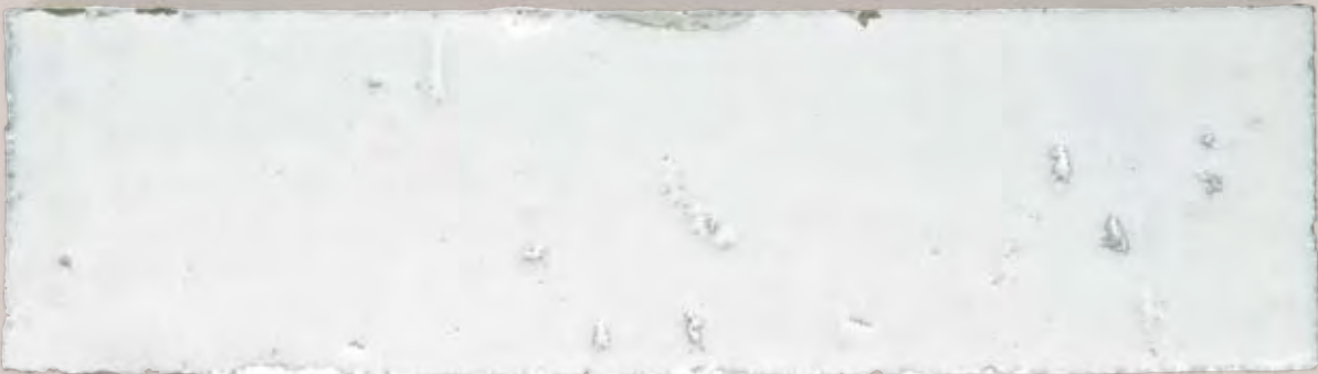
SUGAR WHITE 02-12173-82746