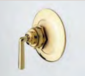
THERMOSTATIC CONTROL VALVE TRIM WITH METAL LEVER HANDLE CHROME 05-77039-25363 NICKEL 05-94346-72733 UNLACQUERED BRASS 05-13553-41194