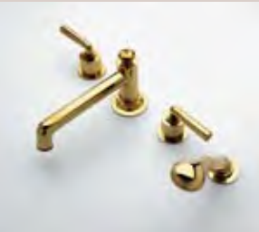
LOW PROFILE CONCEALED TUB FILLER WITH HANDSHOWER AND METAL LEVER HANDLES CHROME 09-07338-33989 NICKEL 09-27667-86962 UNLACQUERED BRASS 09-83465-65803