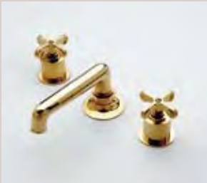
LOW PROFILE THREE HOLE DECK MOUNTED LAVATORY FAUCET WITH METAL CROSS HANDLES CHROME 07-40538-87167 NICKEL 07-00202-58757 UNLACQUERED BRASS 07-01314-00455