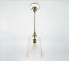
PENDANT CHROME 18-47520-83414 NICKEL 18-26316-14463 UNLACQUERED BRASS 18-18128-57013