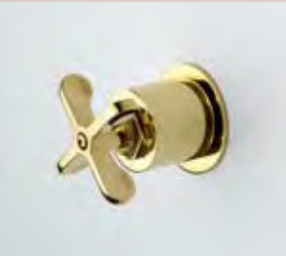
VOLUME CONTROL VALVE TRIM WITH METAL CROSS HANDLE CHROME 05-94734-94866 NICKEL 05-48408-09438 UNLACQUERED BRASS 05-52241-90228