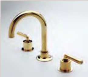
GOOSENECK THREE HOLE DECK MOUNTED LAVATORY FAUCET WITH METAL LEVER HANDLES CHROME 07-34346-60899 NICKEL 07-90138-82813 UNLACQUERED BRASS 07-11494-33975