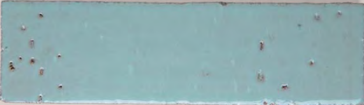
ASHLEY BLUE 02-22999-01004