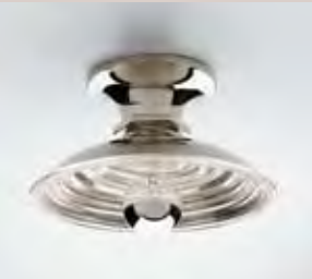
WALL / CEILING MOUNTED SCONCE CHROME 18-53521-42448 NICKEL 18-42298-48500 UNLACQUERED BRASS 18-18160-36811

THE HENRY FITTING COLLECTION IS ALSO AVAILABLE IN MADE-TO-ORDER FINISHES (LIGHTING EXCLUDED)