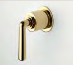
VOLUME CONTROL VALVE TRIM WITH METAL LEVER HANDLE CHROME 05-23492-88147 NICKEL 05-62041-20955 UNLACQUERED BRASS 05-93698-83873