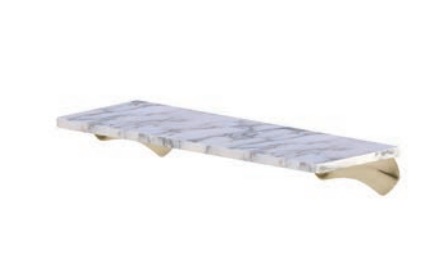
18" Stone Shelf (ISSF18)