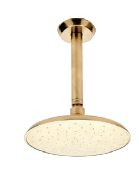
Ceiling Mounted Shower Head, Arm and Flange (ISSH10)