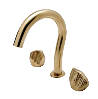
Gooseneck Lavatory Faucet with Metal Petra Handles (ISLS21)