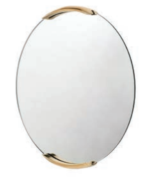
Wall Mounted Mirror (ISMR01)