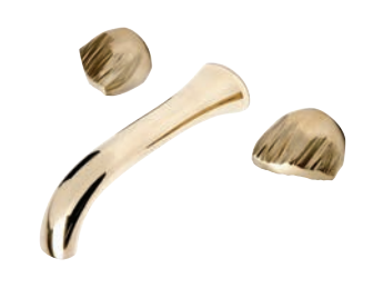
Wall Mounted Lavatory Faucet with Metal Petra Handles (ISLS61)*