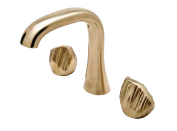
High Profile Lavatory Faucet with Metal Petra Handles (ISLS01)