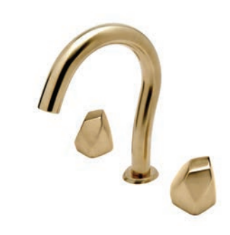
Gooseneck Lavatory Faucet with Metal Geode Handles (ISLS25)