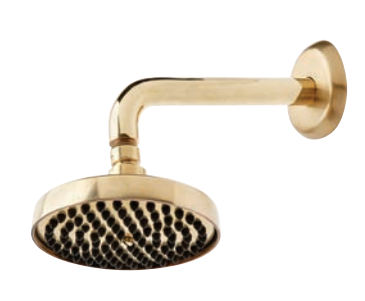
Wall Mounted Shower Head, Arm and Flange (ISSH01)