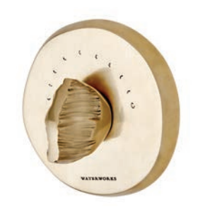
Thermostatic Control Valve Trim with Metal Petra Handle (ISTH01)*