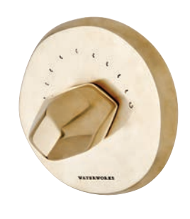
Thermostatic Control Valve Trim with Metal Geode Handle (ISTH05)*