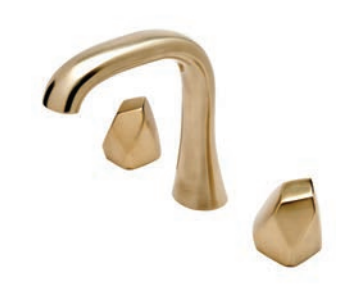
High Profile Lavatory Faucet with Metal Geode Handles (ISLS05)